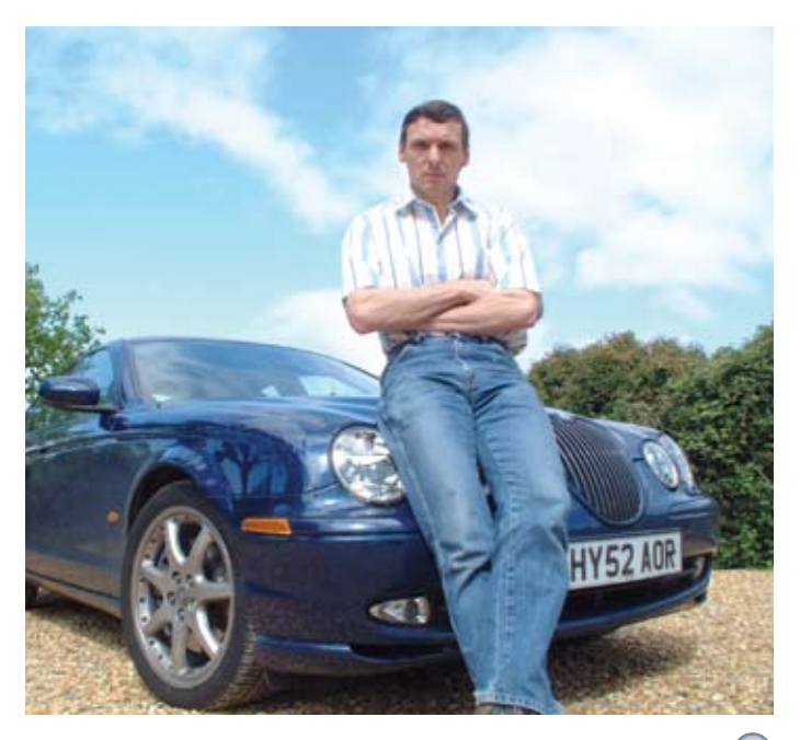
How can anyone with a car this good be wrong?

In the majority of development situations, the ideal of keeping all the trees is just not feasible or in line with government guidance so achieving a tree-rich compromise is probably the best that can be expected. The survey identifies trees that should be a material constraint but that does not mean they have to be kept at all costs. It simply means they should be given appropriate weight in the overall deliberations about what is an appropriate change in land use. If a layout is acceptable in every other planning respect except that it means the loss of a good tree, then it may be entirely appropriate for the planning officer to decide to sacrifice the tree for the greater good. The benefit of identifying that tree as a material constraint is that it then allows arboriculturists to make a very strong case for a significant compensation package for its loss. This could be a number of semi-mature trees planted in better locations that will result in a significant amenity gain in the wider context. My experience is that it is frequently possible to achieve a compromise that results in a better future tree situation than already exists. I believe that one of the most influential roles an arboriculturist has is in the use of this material constraint categorisation as a bargaining tool to secure a future amenity gain.