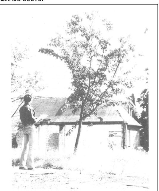
FIGURE 2: Small or young trees: Is it really acceptable that replaceable or transplantable trees should influence long term development layouts?

Young and small trees: Young or small trees should be considered as a special case separate from established and maturing trees because they can be successfully moved or replaced with similar individuals. BRIDGEMAN (1976) recognised that transplantable trees required a separate category. They are a flexible element within the site structure and it is quite unreasonable that their present position should have a long term influence on development layout (Figure 2). Despite having a long SULE in many cases, young or small trees should only be considered for retention if their positions are compatible with the finalised layout design. Flexibility is the key word and they should not significantly influence the layout design stage. In most cases they can be objectively defined in terms of age or size, and should be classed as an additional category to the subjective divisions outlined above.